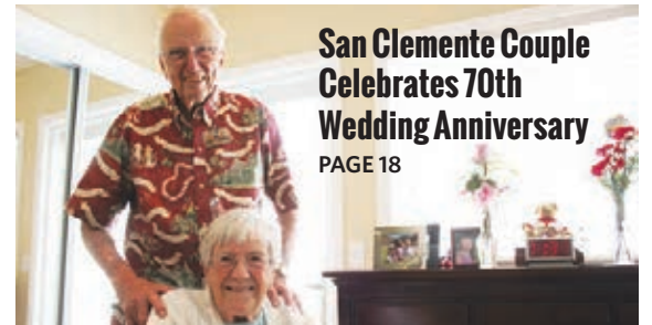
San Clemente Couple Celebrates 70th Wedding Anniversary PAGE 18